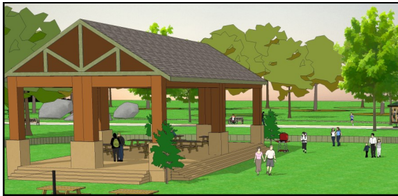
3d Illustration of Park Center

Due to rising development pressures stemming from the adjacent Highlands Area, the Township of Fredon faced significant challenges that threatened to impact its population, circulation, rural character and environmentally sensitive lands . Concerned for its future, the Township reached out to Burgis Associates, Inc. to assist in the development of a Master Plan that would successfully respond to these pressures. The result was the Township of Fredon 2007 Comprehensive Master Plan , a complete and comprehensive document that represents the culmination of six years of preparation.