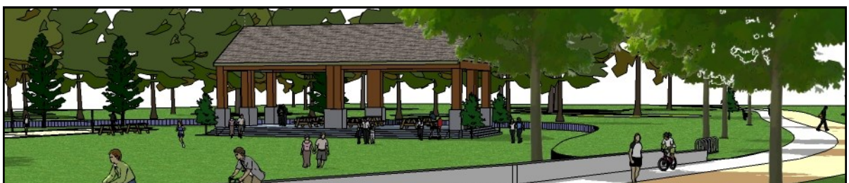
3d Illustration of Park Center