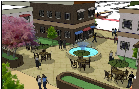
3d Simulations of Facades, Outdoor Café, Public Plaza