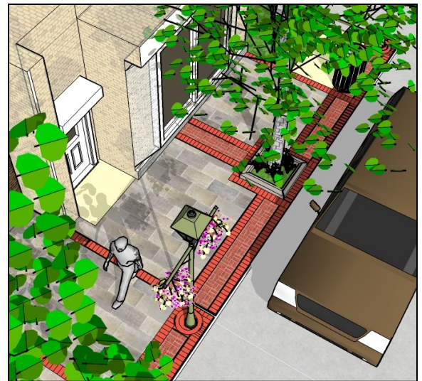
Streetscape Improvement Illustrations